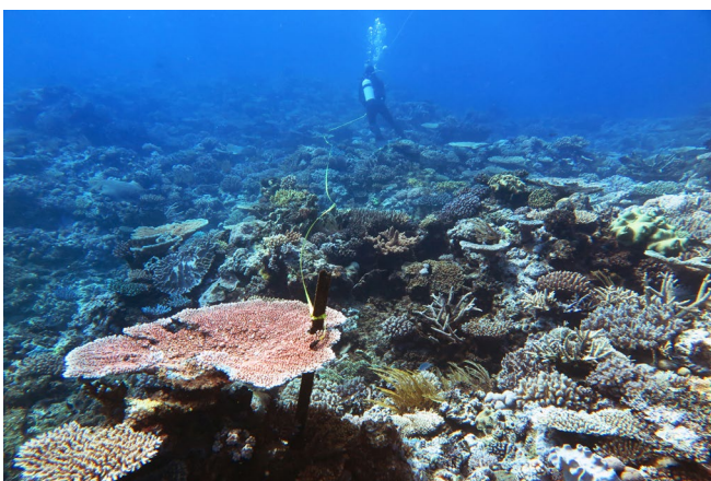
Thetford Reef near Cairns. 2016 before coral bleaching.

Increasing sea temperature is likely to increase the proportion of severe tropical cyclones and the frequency and severity of heavy rainfall events. 12